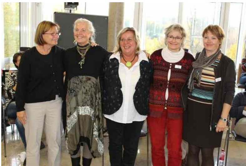
Council 2012 - 2015

The DFP is the German professional organization for psychodrama. It is an accrediting organization with the function, to represent the professional, technical and political interests of psychodramatists in Germany. Among engagement in networking among psychodramatists, training institutes and organizations of PD (like FEPTO) and other methods in Germany and international, the DFP promotes the development and promotion of psychodrama and engages in research and the publishing of books. This task is done in cooperation with the accredited institutes for psychodrama training; these are eight at the moment (see below) and a ninth one is in the state of application. The institutes are cooperative members.