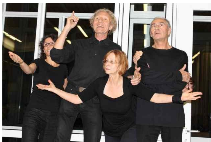
Play back group "Spiegelbühne" Frankfurt

To become a regular member you need to be a certified psychodramatists trained at an accredited institute. Students can become extraordinary members. The certificates accepted are psychodrama therapist, pd director, pd therapist for drug addicts, therapist for pd with children.